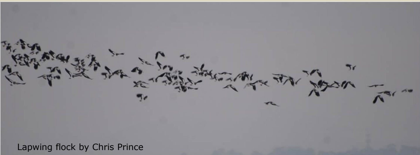
Lapwing flock

Many small birds that are only encountered in ones and twos during the breeding season form flocks in the winter, making them easier to see. At times around the reserve there can, for instance, be flocks of skylarks, meadow pipits, fieldfares, redwings, long-tailed tits, chaffinches, goldfinches, linnets and yellowhammers. Members of the tit family often get together in mixed flocks that are joined from time to time by goldcrests and treecreepers.