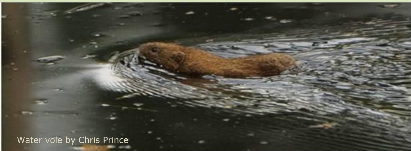
Water vole

Water voles suffered one of the fastest declines of any native mammal and Sussex lost around 90% of its population – the causes are thought to include water pollution, the draining of wetlands and an increase in predators, especially the American mink. So we're really happy to be welcoming them back to Pulborough Brooks!