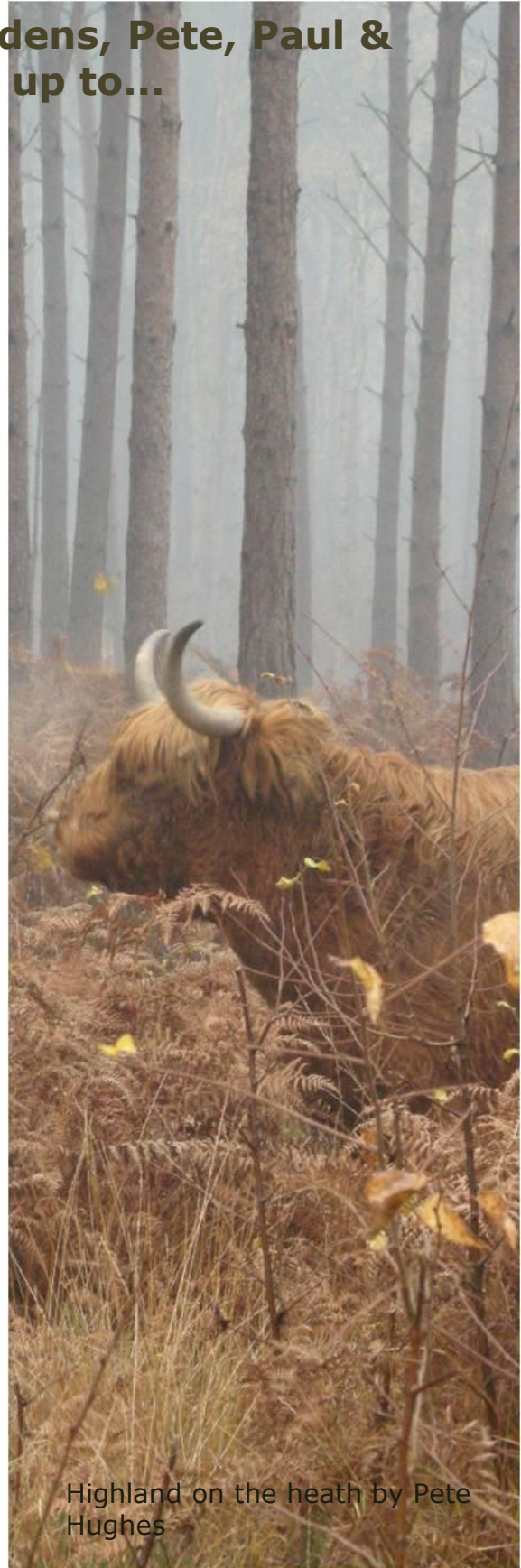
Highland on the heath by Pete Hughes

Down at Black Pond we've re-arranged the fenceline to allow grazing right up to the pond edge and we'll also be extending the pond system to increase the habitat for dragonflies and damselflies. Once this work is completed, we'll be reinstating access and creating a great place to stop and wildlife watch.